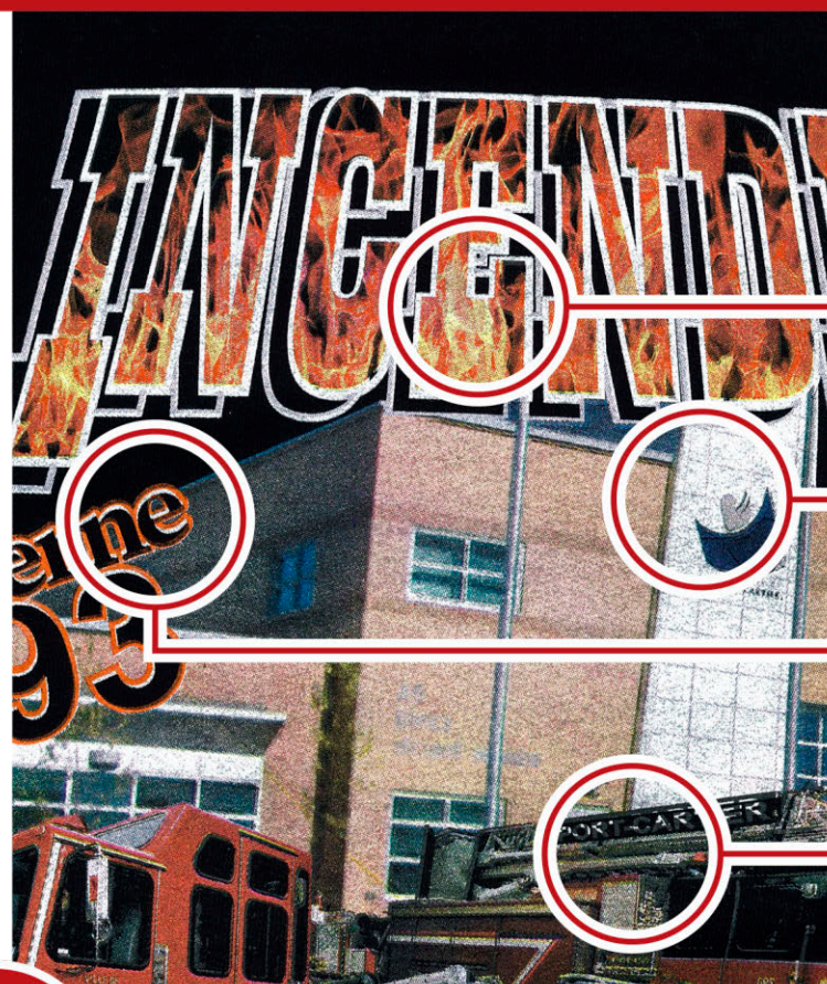
French Terry or fleece